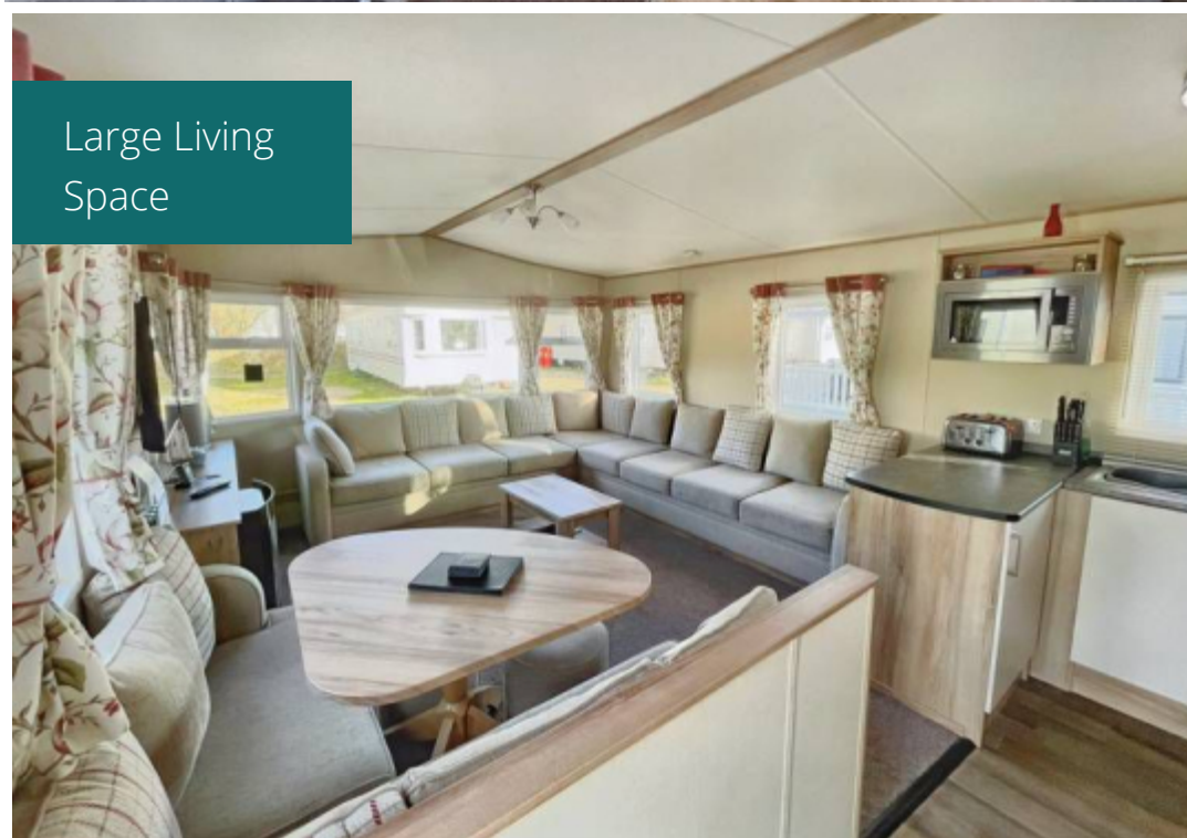
Large Living Space