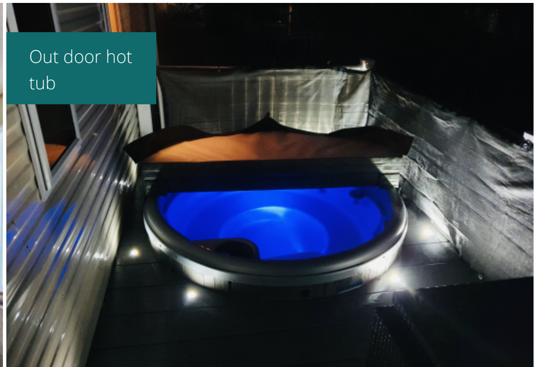
Out door hot tub