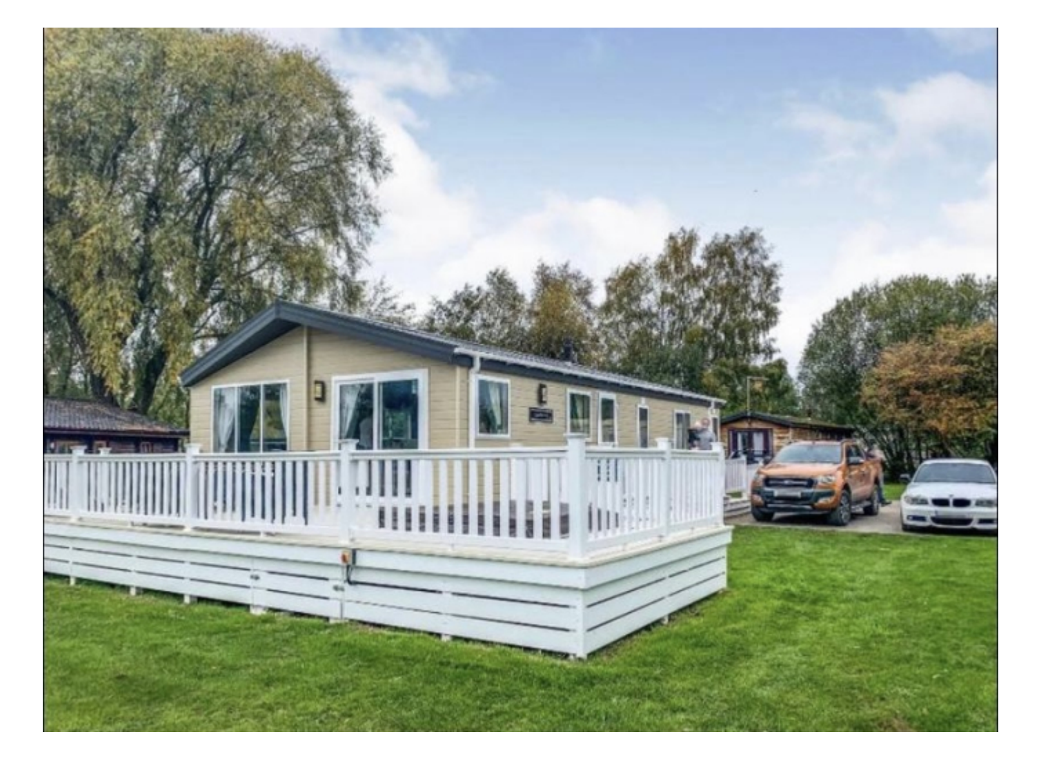
£0 Per Day

Goaty Lodge - 2 The Green, Tattershall lakes, 2 The Green, LN4 4JG Park Home | 3 Bedrooms | 2 Bathrooms